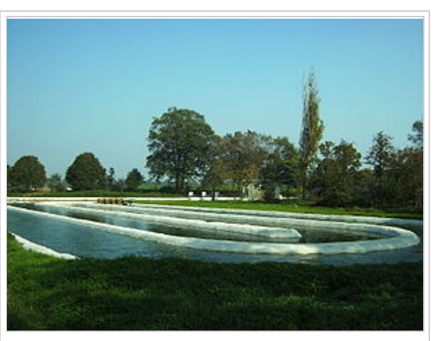
Raceway pond used to cultivate microalgae. The water is kept in constant motion with a powered paddle wheel.

Open pond systems are cheaper to construct, at the minimum requiring only a trench or pond. Large ponds have the largest production capacities relative to other systems of comparable cost. Also, open pond cultivation can exploit unusual conditions that suit only specific algae. For instance, Dunaliella salina grow in extremely salty water; these unusual media exclude other types of organisms, allowing the growth of pure cultures in open ponds. Open culture can also work if there is a system of harvesting only the desired algae, or if the ponds are frequently re-inoculated before invasive organisms can multiply significantly. The latter approach is frequently employed by Chlorella farmers, as the growth conditions for Chlorella do not exclude competing algae.