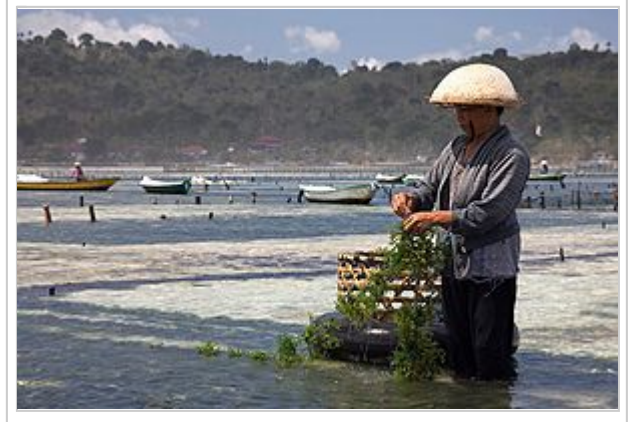
A seaweed farmer in Nusa Lembongan gathers edible seaweed that has grown on a rope.

"Chitosan", a commercial flocculant, more commonly used for water purification, is far more expensive. The powdered shells of crustaceans are processed to acquire chitin, a polysaccharide found in the shells, from which chitosan is derived via deacetylation. Water that is more brackish, or saline requires larger amounts of flocculant. Flocculation is often too expensive for large operations.