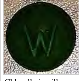
Chlorella in pill form.

Chlorella is consumed as a health supplement primarily in the United States and Canada and as a food supplement in Japan.<sup>[9]</sup> Chlorella has a number of purported health effects,<sup>[10]</sup> including an ability to treat cancer.<sup>[11]</sup> However, according to the American Cancer Society, "available scientific studies do not support its effectiveness for preventing or treating cancer or any other disease in humans".<sup>[11]</sup>