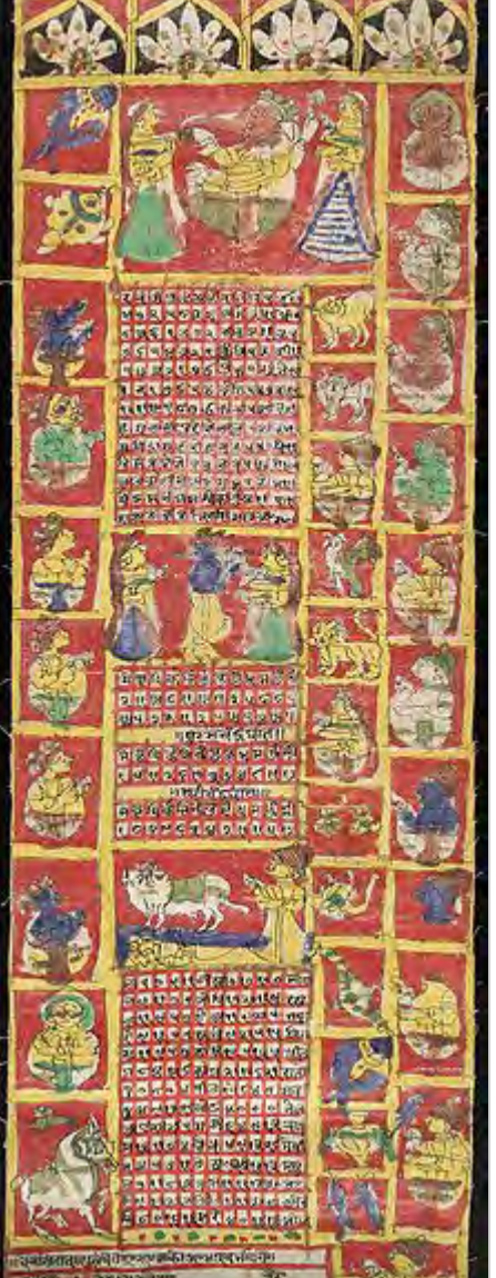
A Hindu almanac ( pancanga ) for the year 1871/2 from Rajasthan (Library