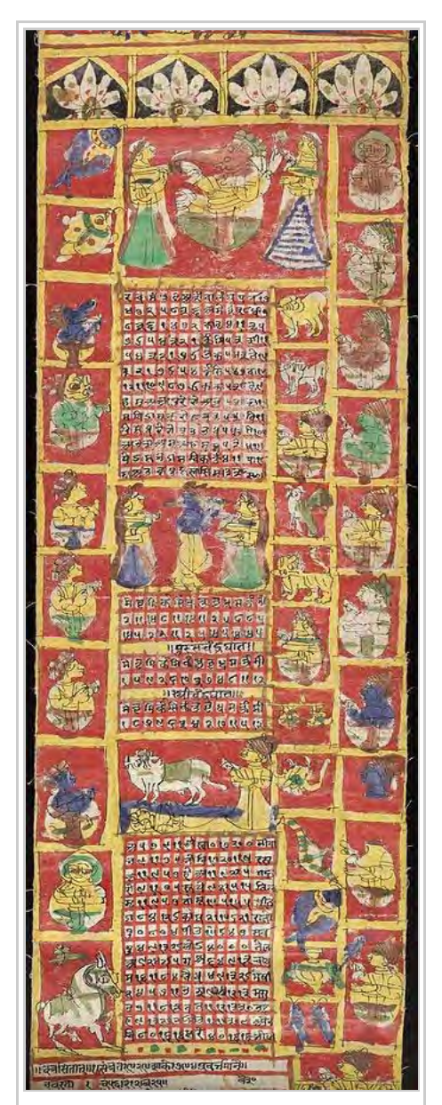
A Hindu almanac ( pancanga ) for the year 1871/2 from Rajasthan (Library of Congress, Asian Division)

The Hebrew calendar is used by Jews worldwide for religious and cultural affairs, also influences civil matters in Israel (such as national