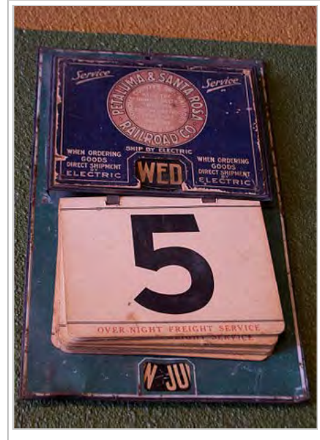
A calendar from the Petaluma and Santa Rosa Railroad

Calendaring software provides users with an electronic version of a calendar, and may additionally provide an appointment book, address book or contact list. Calendaring is a standard feature of many PDAs, EDAs, and smartphones. The software may be a local package designed for individual use (e.g., Lightning extension for Mozilla Thunderbird, Microsoft Outlook without Exchange Server, or Windows Calendar) or