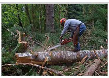
Logging near Apiary, Oregon

Two-stroke chainsaws require about 2–5% of oil in the fuel to lubricate the motor, while the motor in electrical chain-saws is normally lubricated for life. Most modern gas operated saws today require a fuel mix of 2% (1:50). Regular gas from most gas stations contain 5 to 10% ethanol which can result in problems of the equipment. Ethanol dissolves plastic, rubber and other material. His leads to problems especially on older equipment. A workaround of this problem is to run fresh fuel only and run the saw dry at the end of the work.