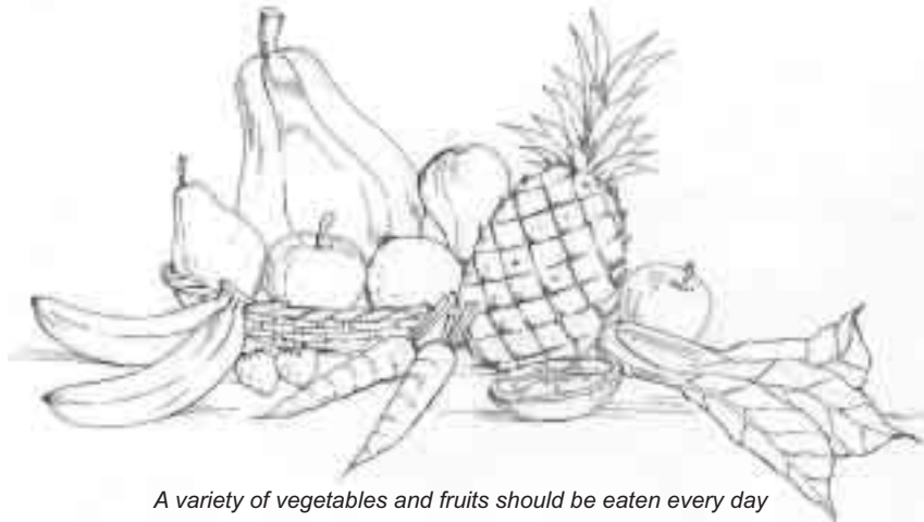
A variety of vegetables and fruits should be eaten every day

Food based sources of vitamins and minerals are the best choice. The use of multivitamins is recommended over the use of taking an individual micronutrient, because excesses of some single micronutrients can be harmful. Multivitamins are not a “ magic bullet ”, in that they should not replace healthful food choices. Fortified/enriched foods, cereals and grains, where available and affordable, are also a good source of some essential vitamins and minerals and can be incorporated as part of a nutritious diet.