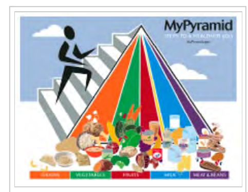
The USDA's updated food pyramid from 2005, MyPyramid.