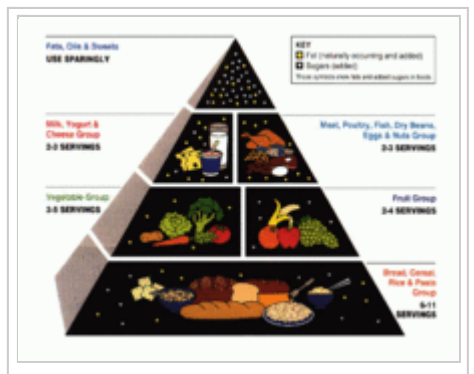
The USDA's original food pyramid from 1992, (OUTDATED)<sup>[9]</sup>

These foods provide complex carbohydrates, which are an important source of energy, especially for a low-fat meal plan. Examples include corn, wheat, and rice.