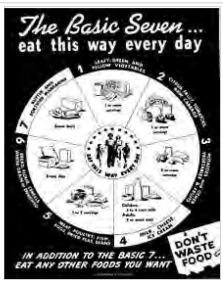
The "Basic Seven" developed by the United States Department of Agriculture

The World Health Organization, in conjunction with the Food and Agriculture Organization, published guidelines that can effectively be represented in a food pyramid relating to objectives to prevent obesity, chronic diseases and dental caries based on meta-analysis <sup>[7][8]</sup> though they represent it as a table rather than a "pyramid". The structure is similar in some respects to the USDA food pyramid, but there are clear distinctions between types of fats, and a more dramatic distinction where carbohydrates are split on the basis of free sugars versus sugars in their natural form. Some food substances are singled out due