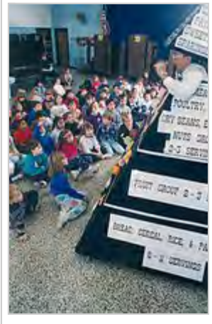
Inside the pyramid