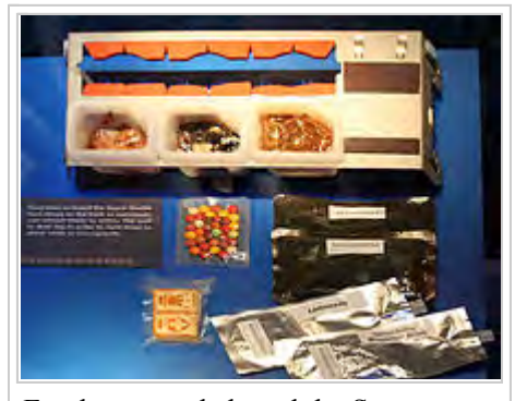
Food tray used aboard the Space Shuttle

Packaging for space food serves the primary purposes of preserving and containing the food. The packaging, however, must also be light-weight, easy to dispose and useful in the preparation of the food for consumption. The packaging also includes a bar-coded label, which allows for the tracking of an astronaut's diet. The labels also specify the food's preparation instructions in both English and Russian.<sup>[28]</sup>