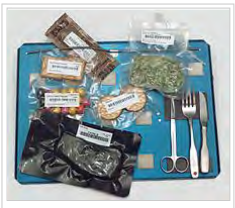
Food aboard the Space Shuttle served on a tray. Note the use of magnets, springs, and Velcro to hold the cutlery and food packets to the tray