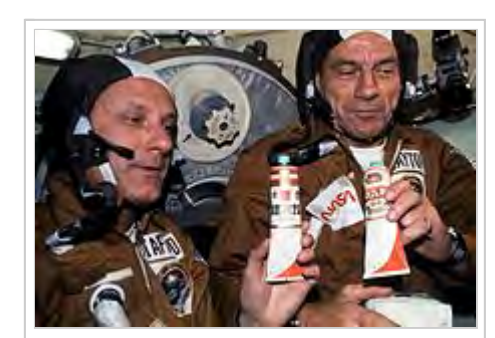
NASA astronauts enjoying space "vodka": the tubes hold borscht over which vodka labels have been pasted

Today, fruits and vegetables that can be safely stored at room temperature are eaten on space flights. Astronauts also have a greater variety of main courses to choose from, and many request personalized menus from lists of available foods including items