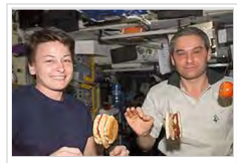
Astronauts making and eating hamburgers on board the ISS August 2007.

Astronauts in later Mercury missions (1959–1963) disliked the food that was provided. They ate bite-sized cubes, freeze-dried powders, and tubes of semiliquids. The astronauts found it unappetizing, experienced difficulties in rehydrating the freeze-dried foods, and did not like having to squeeze tubes or collect