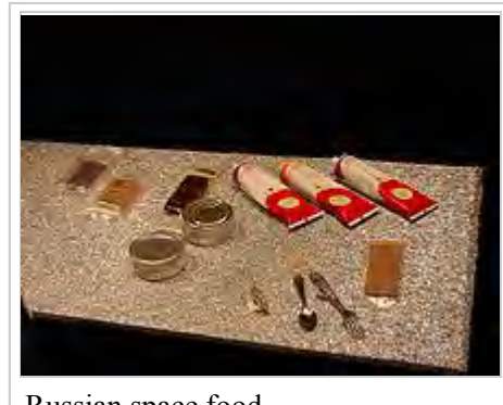
Russian space food

Carbonated drinks have been tried in space, but are not favored due to changes in belching caused by microgravity; without gravity to separate the liquid and gas in the stomach, burping results in a kind of vomiting called "wet burping". [28] Coca-Cola and Pepsi were first carried on STS-51-F in 1985. Coca-Cola has