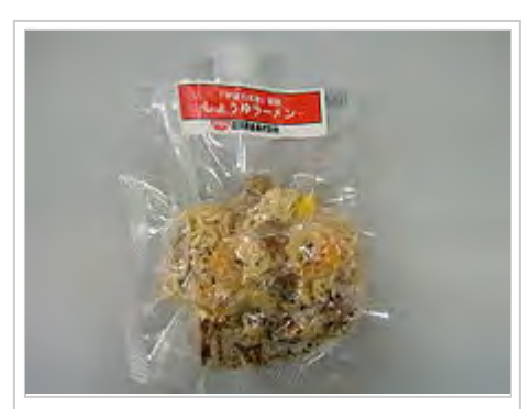
Rehydratable Shōyu flavoured Japanese ramen from JAXA.