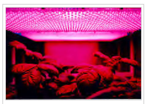
Red LED lights illuminate potato plants in a NASA study on growing food in space