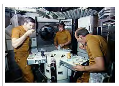
Skylab 2 crew eats food during ground training

Menus included 72 items; for the first time about 15% was frozen. Shrimp cocktail and butter cookies were consistent favorites; Lobster Newburg, fresh bread,<sup>[11]</sup> processed meat