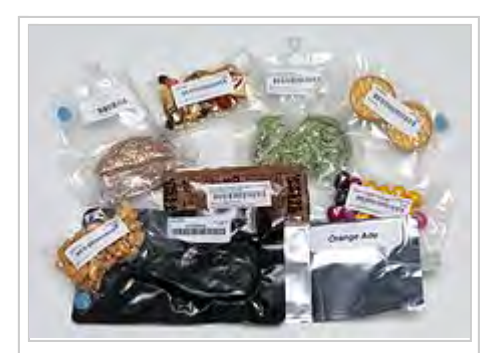
Assortment of foods like those served aboard the ISS.