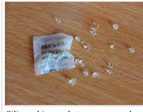
Silica gel in a sachet or porous packet