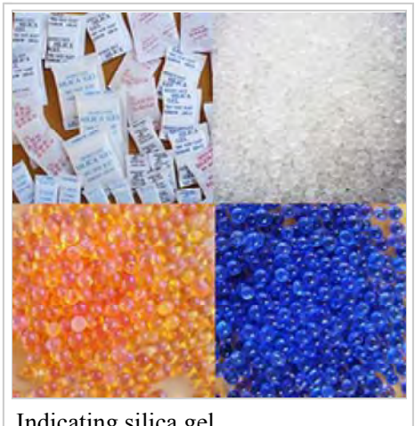
Indicating silica gel

One example of desiccant usage is in the manufacture of insulated windows where zeolite spheroids fill a rectangular spacer tube at the perimeter of the panes of glass. The desiccant helps to prevent the condensation of moisture between the panes.