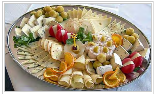
A platter with cheese and garnishes