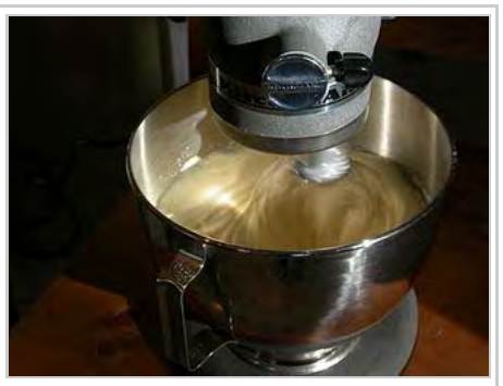
KitchenAid Stand Mixer in action