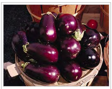
Eggplants, also called Aubergines.