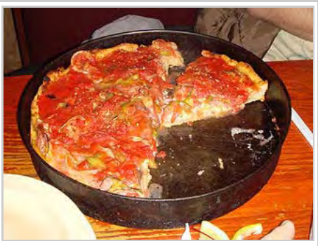
Chicago-style deep-dish pizza from the original Pizzeria Uno location