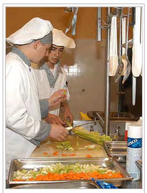
Food preparation at the Naval Air Station, Whidbey Island, Washington state