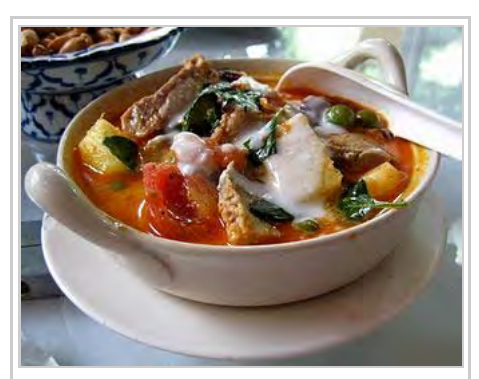
Thai Kaeng phet pet yang : roast duck in red curry