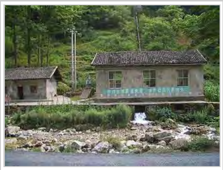
Hongping Power station, in Hongping Town, Shennongjia, has a design typical for small hydro stations in the western part of China's Hubei Province. Water comes from the mountain behind the station, through the black pipe seen in the photo

Other small hydro schemes may use tidal energy or propeller-type turbines immersed in flowing water to extract energy. Tidal schemes may require water storage or electrical energy storage to level out the intermittent (although exactly predictable) flow of power.