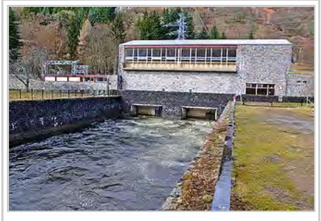
Small 2MW hydro in Perthshire, Scotland

Small hydro plants may be connected to conventional electrical distribution networks as a source of low-cost renewable energy. Alternatively, small hydro projects may be built in isolated areas that would be uneconomic to serve from a network, or in areas where there is no national electrical distribution network. Since small hydro projects usually have minimal reservoirs and civil construction work, they are seen as having a relatively low environmental impact compared to large hydro. This decreased environmental impact depends strongly on the balance between stream flow and power production. One tool that helps