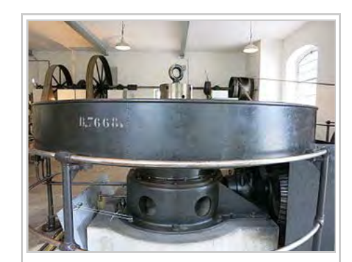
Historic small hydro with original equipment of 1920 in Ottenbach, Switzerland, still running for guided visits

Small hydro is often developed using existing dams or through development of new dams whose primary purpose is river and lake water-level control, or irrigation. Occasionally old, abandoned hydro sites may be purchased and re-developed, sometimes salvaging substantial parts of the installation such as penstocks and turbines, or sometimes just re-using the water rights associated with an abandoned