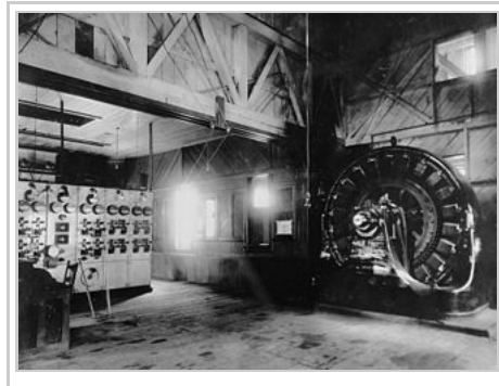
An 1895 hydroelectric plant near Telluride, Colorado.

evaluate this issue is the Flow Duration Curve or FDC. The FDC is a Pareto curve of a stream's daily flow rate vs. frequency. Reductions of diversion help the river's ecosystem, but reduce the hydro system's Return on Investment (ROI). The hydro system designer and site developer must strike a balance to maintain both the health of the stream and the economics.