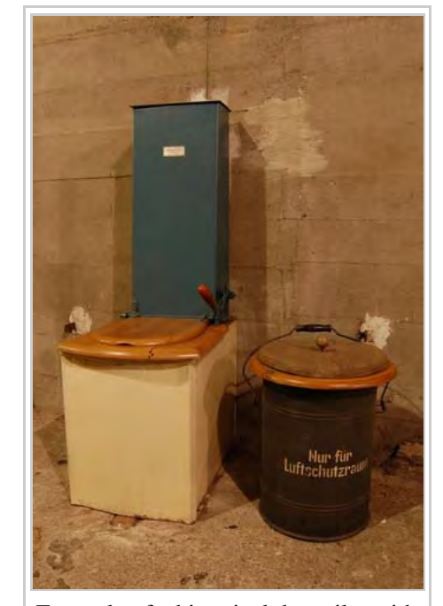
Example of a historical dry toilet with peat dispenser which was used in bunkers during World War II in Berlin (Metroclo by Gefinal)

Dry toilets are used in developed countries, e.g. many Scandinavian countries (Sweden, Finland, Norway) for summer houses and national parks. They are more widely used in developing countries in situations where flush toilets connected to septic tanks or sewer systems are not