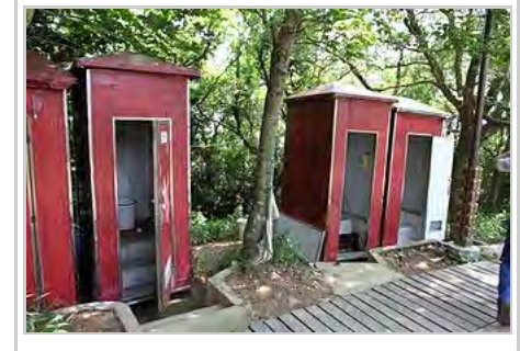
Portable toilet on top of a mountain in China