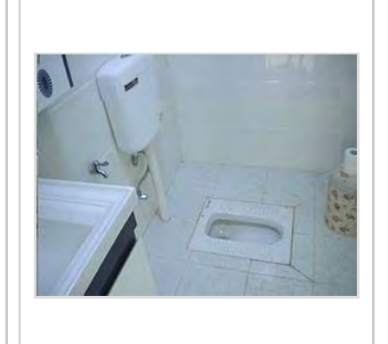
Porcelain squat toilet, with water tank for flushing (Wuhan, China)