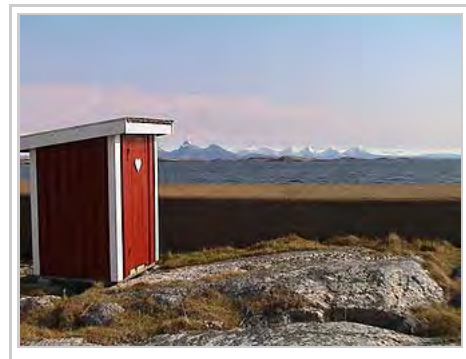
Pit latrines are still in use in rural areas of wealthy countries (Herøy, Norway)

The waste pit or trench can be dug large enough that the reduction in mass of the contained waste products by the ongoing process of decomposition allows the pit to be used for many years before it fills up. When the pit becomes too full, it may be emptied or the hole covered with earth. Pit latrines have to be located away from drinking water sources (wells, streams, etc.) to minimize the possibility of disease spread via groundwater pollution.