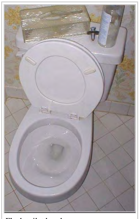
Flush toilet bowl

A pit toilet, or pit latrine, is a dry toilet system which collects human excrement in a pit or trench, ranging from a simple slit trench to more elaborate systems with seating or squatting pans and ventilation systems. In developed countries they are associated with camping and wilderness areas, whereas they are common in rural or peri-urban areas of much of the developing world. Pit toilets are used in emergency situations.