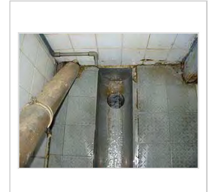
Old-style squat toilet (Hong Kong)