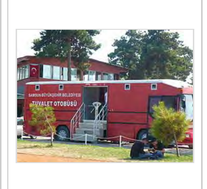
Toilet bus in Samsun