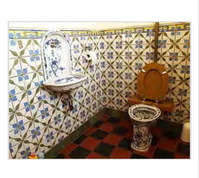
Toilet in Delftware style