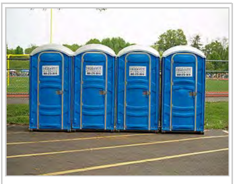
A line of portable toilets