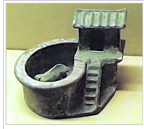
Model of toilet with pigsty, China, Eastern Han dynasty 25 - 220 AD

BC, yielded important clues about early Southeast Asian society. More than 30 coprolites, containing fish and shattered animal bones, provided information on the diet of humans and dogs, and on the types of parasites each had to contend with.<sup>[29][30][31]</sup>