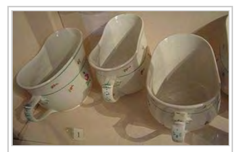
Bourdaloue chamber pots from the Austrian Imperial household

By the 16th century, cesspits and cesspools were increasingly dug into the ground near houses in Europe as a means of collecting waste, as urban populations grew and street gutters became blocked with the larger volume of human waste. Rain was no longer sufficient to wash away waste from the gutters. A pipe connected the latrine to the cesspool, and sometimes a small amount of water washed waste through. Cesspools were cleaned out by tradesmen, who pumped out liquid waste, then shovelled out the solid waste and collected it during