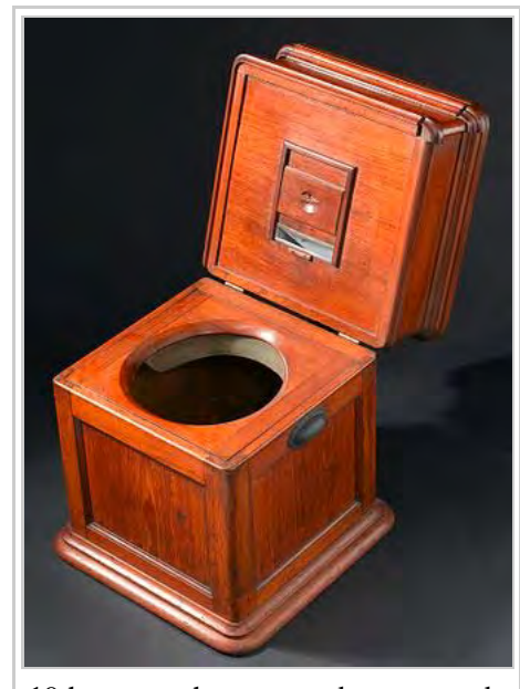
19th century heavy wooden commode to enclose chamber pot

With rare exceptions, chamber pots are no longer used. Modern related implements are bedpans and commodes, used in hospitals and the homes of invalids.