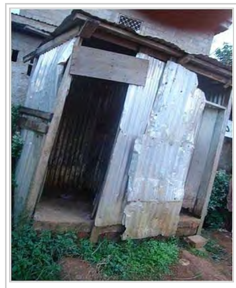
A poorly maintained pit latrine in Yaounde, Cameroon

Chemical toilets which do not require a connection to a water supply are used in a variety of situations. Examples include passenger train toilets and airplane toilets and also complicated space toilets for use in zero-gravity spacecraft.