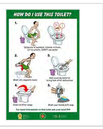
Instructions on using a urine-diverting dry toilet