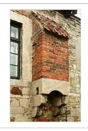
Exterior view of garderobe at Campen castle

The other main way of handling toilet needs was the chamber pot, a receptacle, usually of ceramic or metal, into which one would excrete waste. This method was used for hundreds of years; shapes, sizes, and decorative variations changed throughout the centuries.<sup>[35]</sup> Chamber pots were in common use in Europe from ancient times, even being taken to the Middle East by medieval pilgrims.<sup>[36]</sup>