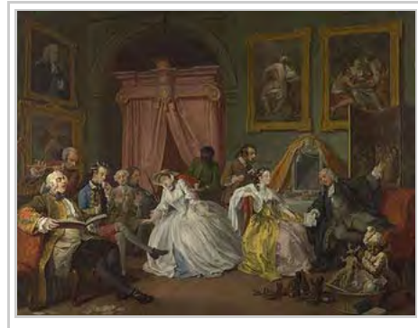
In La Toilette from Hogarth's Marriage à la Mode series (1743), a young countess receives her lover, tradesmen, hangers-on, and an Italian tenor as she finishes her toilette<sup>[41]</sup>

The word "toilet", for the plumbing fixture or for the room, is considered impolite in some varieties of English, while elsewhere the word is used without any embarrassment. "Toilet" was by etymology a euphemism, but is no longer understood as such. As old euphemisms have become the standard term, they have been progressively replaced by newer ones, an example of the euphemism treadmill at work. [46] The choice of word relies not only on regional variation, but also on social