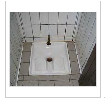
Squat toilet as seen in some parts of Europe and Asia

In 1976, squatting toilets were said to be used by the majority of the world's population.<sup>[17]</sup> However, there is a general trend in many countries to move from squatting toilets to sitting toilets (particularly in urban areas) as the latter are often regarded as more modern.<sup>[18]</sup>