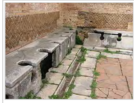
Roman public toilets, Ostia Antica.

In 2012, archaeologists found what is believed to be Southeast Asia's earliest latrine during the excavation of a neolithic village in the Rach Núi archaeological site, southern Vietnam. The toilet, dating back 1500