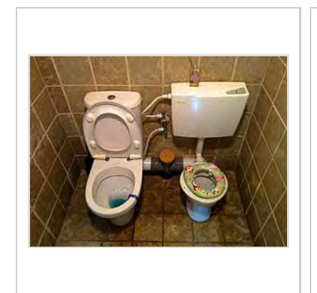
Duo toilet for child training in a banquet hall near Jerusalem, Israel