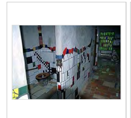
Men's toilet designed by artist and architect Hundertwasser