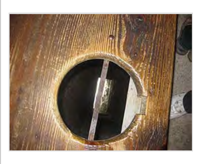
View looking down into garderobe seat opening