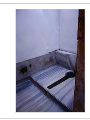
Squat toilet in Topkapi palace