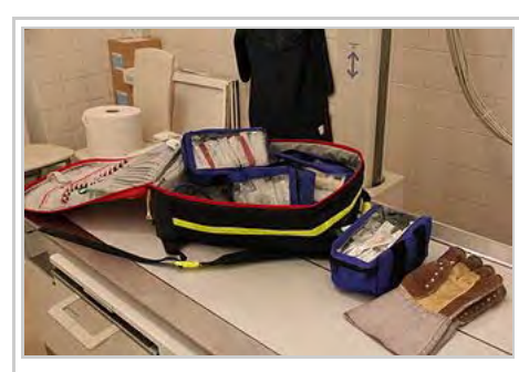
For on-call ambulance duty