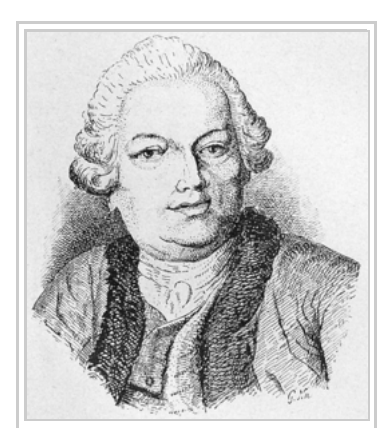
Claude Bourgelat established the earliest veterinary college in Lyon in 1761.

The Odiham Agricultural Society was founded in 1783 in England to promote agriculture and industry,<sup>[4]</sup> and played an important role in the foundation of the veterinary profession in Britain.<sup>[5]</sup> A 1785 Society meeting resolved to "promote the study of Farriery upon rational scientific principles."