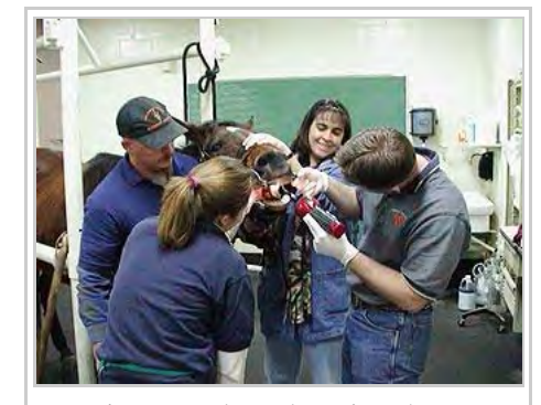
Veterinary students learning the dental treatment of a horse.

Degrees in veterinary medicine culminate in the award of a veterinary science degree, although the title varies by region. For instance, in North America, graduates will receive a Doctor of Veterinary Medicine (Doctor of Veterinary Medicine or Veterinariae Medicinae Doctor; DVM or VMD), whereas in the United Kingdom or India they would be awarded a Bachelor's degree in Veterinary Science, Surgery or Medicine (BVS, BVSc, BVetMed or BVMS), and in Ireland graduates