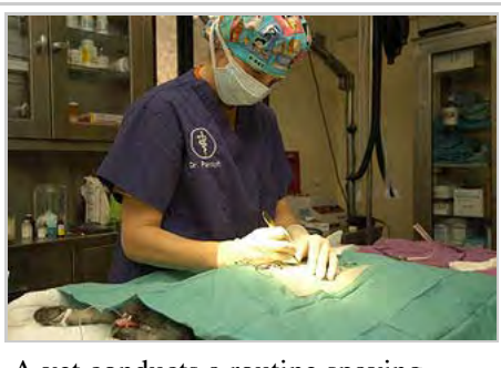
A vet conducts a routine spaying operation on a domestic cat.