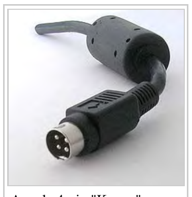
A male 4-pin "Kycon" power connector, which appears similar to a Mini-DIN connector