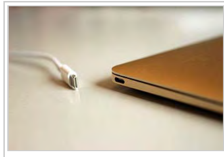
The 12-inch 2015 MacBook uses a USB Type-C port for charging