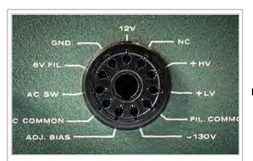
Heathkit power supply female connector for tube equipment

■ Many manufacturers make special-purpose DC power connectors