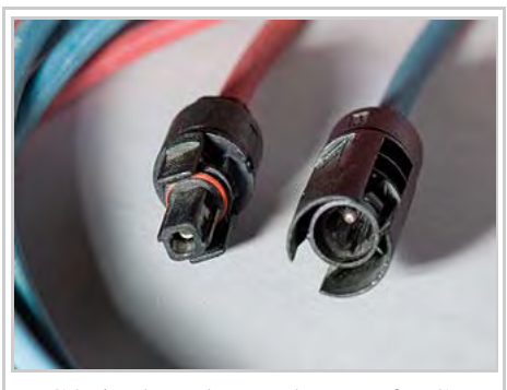
MC4 single-pole weatherproof DC connectors designed for photovoltaic panels

identical to octal relay sockets or tube sockets, were used to connect power supplies to some tube audio amplifiers, transmitters and tranceivers (especially in amateur radio models). Female sockets were installed on the power supply and male sockets (with exposed pins) on the radio equipment. Cable assemblies with mating connectors were also readily available. These connections transferred anode positive voltage (typically 600 VDC for Heathkit, 800 VDC for Collins), grid negative bias (-130 VDC), 6.3 and 12.6 VAC for heaters (filaments), and control functions (remote mains switching).