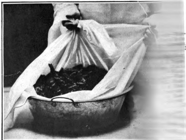
Packing the product to be canned in cheesecloth for blanching