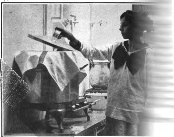
Home canning club member, showing how she uses wash boiler for a canning outfit by simply providing bottom or blanching crate and cover cloth in order to the cover tight and conserve heat