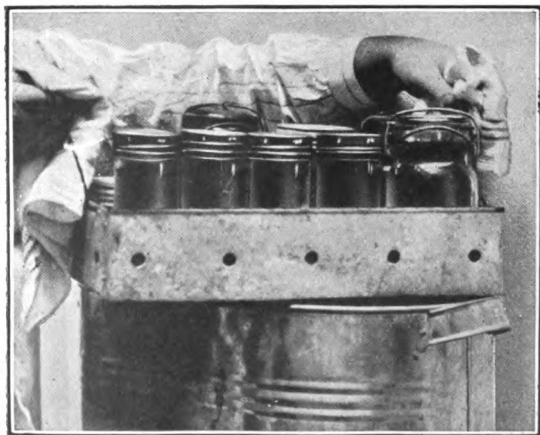
A tray of packed jars just after removal from sterilizing bath in a homemade water-bath outfit. The jars are ready for sealing