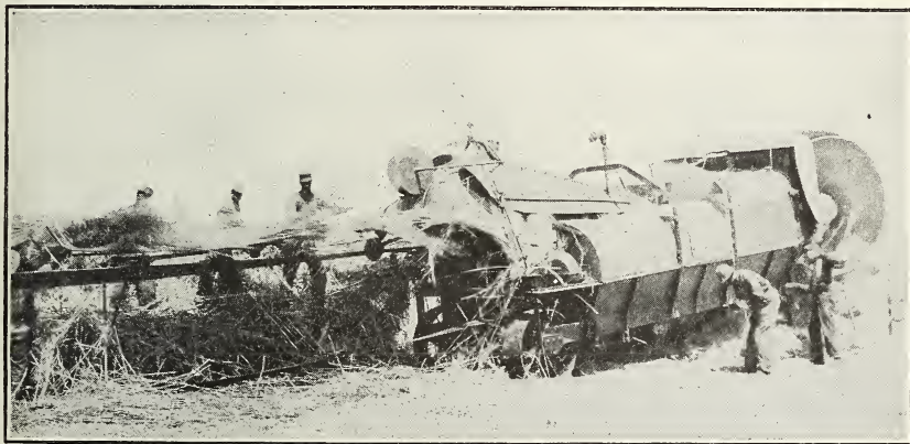
FIG. 1.—Hemp-breaking machine. The stalks are fed sidewise in a continuous layer 2 to 3 inches thick, turning out about 4,000 pounds of clean fiber per day and five times as much hurds.

The yield of hemp fiber varies from 400 to 2,500 pounds per acre, averaging 1,000 pounds under favorable conditions. The weight of