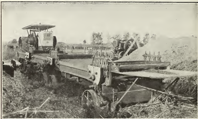
FIG. 2.—Machine brake and hemp hurds. Hemp hurds from machine brakes quickly accumulate in large piles.

Machine brakes are used in Wisconsin, Indiana, Ohio, and California, but to only a limited extent in Kentucky. Five different kinds of machine brakes are now in actual use in this country, and still others are used in Europe. All of the best hemp in Italy, commanding the highest market price paid for any hemp, is broken by machines. The better machine brakes now in use in this country prepare the fiber better and much more rapidly than the hand brakes, and they will undoubtedly be used in all localities where hemp raising is introduced as a new industry. They may also be used in Kentucky when their cost is reduced to more reasonable rates, so that they may compete with the hand brake. Hemp-breaking machines are being