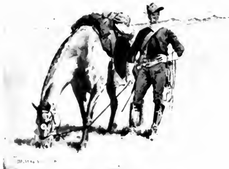
A NIBBLE ON THE MARCH.

veering around now to the northeast, crossed almost at right angles the Indian trail from the reservation and the camps of Sitting Bull. Up, to the eastward, over the broad lands of the Sioux, rose the sun, as the long column came winding over the tumbling range, and on we pressed, hour after hour, until at 11 o'clock we halted, unsaddled and picketed around the palisade guard of the spring. Here men and horses had substantial lunch, and then came the longest stretch of all. Following close by the Black Hills road, east-north-east, over a rolling, treeless prairie, Merritt led the column, four and a half miles an hour now, at the very least, with only brief and occasional halts. A more rapid pace could hardly be ventured, because of the great dust clouds sure to hover over the column.