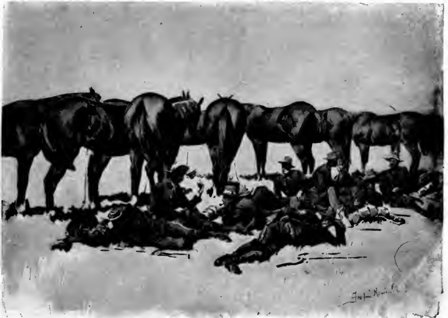
A HALF HOUR'S HALT.

tack on Sitting Bull's villages on the Greasy Grass (Little Horn), far to the northwest. Two or three lively chases sufficed to assure the Indians at the reservation that another route would be preferable, and they quit coming our way. Then the regiment was recalled, and, halting at an infantry-guarded palisade on the Black Hills road, about seventy miles from Fort Laramie and near the spring at the head of what was then called Sage creek, we heard, on the morning of July 7th, the direful news of the Custer massacre. On Wednesday, July 12th, under orders from General Sheridan, the Fifth cavalry started for Fort Laramie to refit, and then, by way of Fetterman and old Fort Reno, to go to reinforce General Crook. Camping at Cardinal's Chair that night, and under the lee of Rawhide Butte the next, we mounted on the morning of the 14th, expecting to go in to Laramie in one long march, and were surprised when headed eastward instead and led on down the Rawhide, which soon bore away to the southeast. Towards noon, General Merritt ordered halt and unsaddle at the crossing of the road from Laramie to the Indian reservation, and that "something