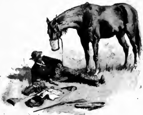
A HALT FOR LUNCH.

At midnight the wagons caught up. Three hours later, under the twinkling stars, every man was astir, the horses getting a good feed of oats from the wagons, the bipeds a hearty breakfast of bacon and coffee. Then "mount and away," still northward, still far to the west of the reservation, and, with the dawn, Merritt, on his big, swift gray, was making the pace for the column as we wound up the steep ascent to the divide between the Niobrara and Cheyenne basins. At this stage of the game we were fifty and the Cheyennes some twenty-five miles from the point where the Black Hills road,