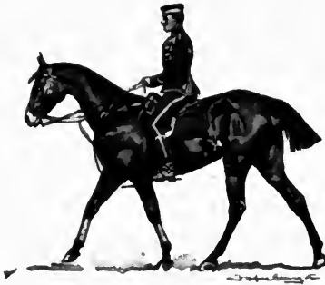
GERMAN HUSSAR, LONG-DISTANCE RIDING.

much to harp upon the cruelty or uselessness of the other system, as to illustrate, however faintly, the better points of our own. It may, at some far distant period, have been necessary for a courier to ride four hundred miles at top-speed on a single horse, but it is not likely to occur again. How many miles a light, athletic rider could cover in a