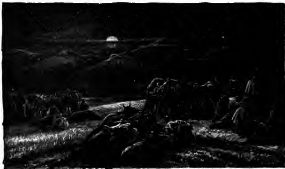
SHORT NIGHT'S REST ON A LONG MARCH IN THE BAD LANDS.