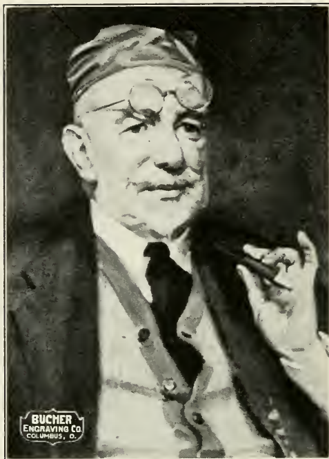
EDWARD W. SCRIPPS (1854-1926)