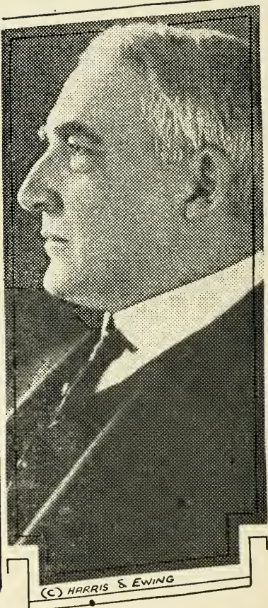
WARREN G. HARDING