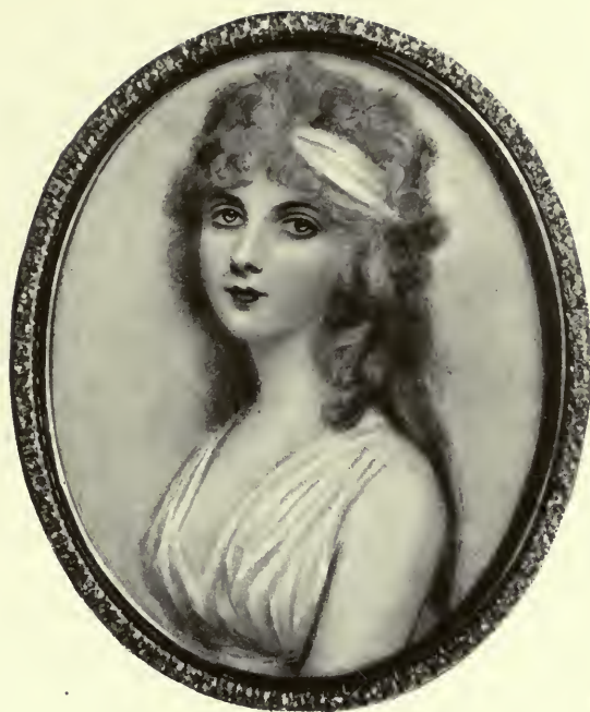
THE HON. HARRIET RUSHOUT (Ob. 1851) BY ANDREW PLIMER