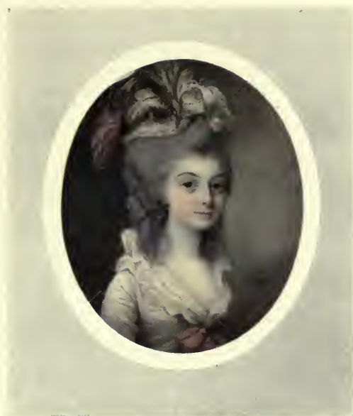
LADY MARY ELIZABETH NUGENT, AFTERWARDS MARCHIONESS OF BUCKINGHAM, AND IN HER OWN RIGHT, BARONESS NUGENT (OB. 1812) BY HORACE HONE