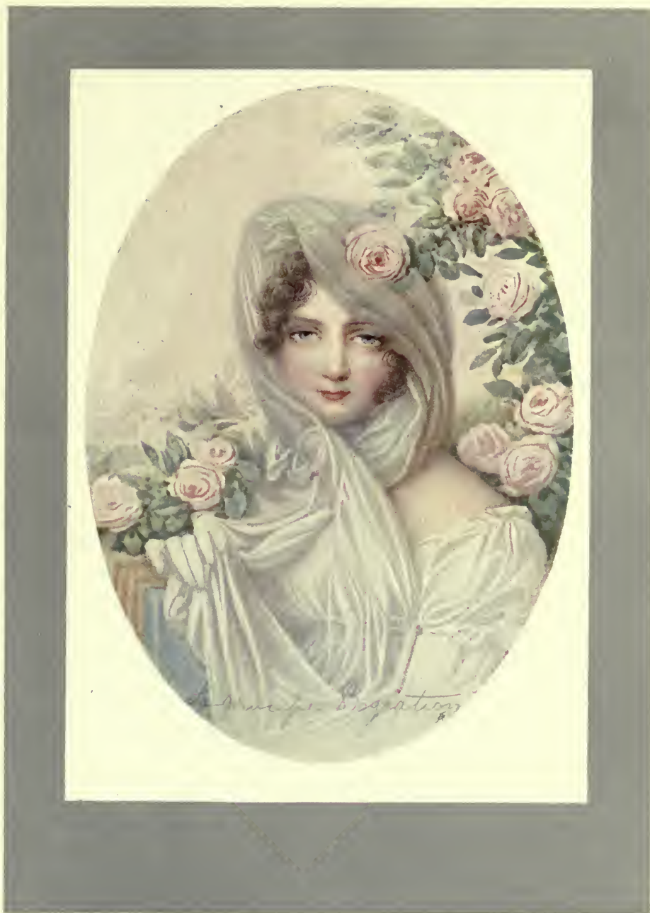
FÜRSTIN KATHARINA BAGRATION SKAWRONSKA BY JEAN BAPTISTE ISABEY (1812)

111 111 111 111 111 111 111 111 111 111 111 111 111 111 111 111 111 111 111 111 111 111 111 111 111 111 111 111 111 111 111 111 111 111 111 111 111 111 111 111