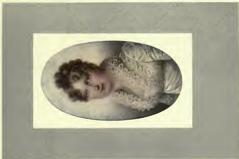
THE EMPRESS MARIE LOUISE BY JEAN BAPTISTE ISABEY