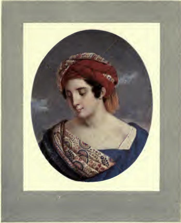
PRINCESS PAULINE BORGHESE BY B. ANGUISSOLA