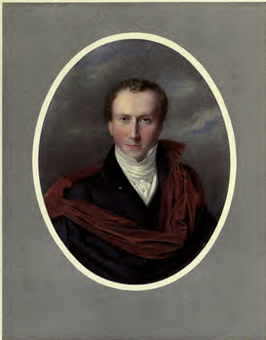
PORTRAIT OF THE ARTIST (1793-1865) BY FERDINAND GEORG WALDMÜLLER