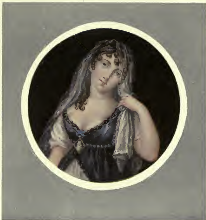
MADAME RÉCAMIER BY J. B. JACQUES AUGUSTIN

1 2 3 4 5 6 7 8 9 10 11 12 13 14 15 16 17 18 19 20 21 22 23 24 25 26 27 28 29 30 31 32 33 34 35 36 37 38 39 40 41 42 43 44 45 46 47 48 49 50 51 52 53 54 55 56 57 58 59 60 61 62 63 64 65 66 67 68 69 70 71 72 73 74 75 76 77 78 79 80 81 82 83 84 85 86 87 88 89 90 91 92 93 94 95 96 97 98 99 100