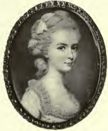
PORTRAIT OF A LADY (NAME UNKNOWN) BY JOHN SMART