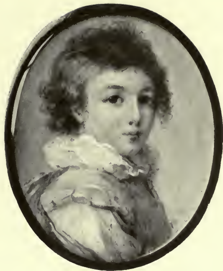
PORTRAIT OF A BOY (NAME UNKNOWN) BY JEAN HONORÉ FRAGONARD