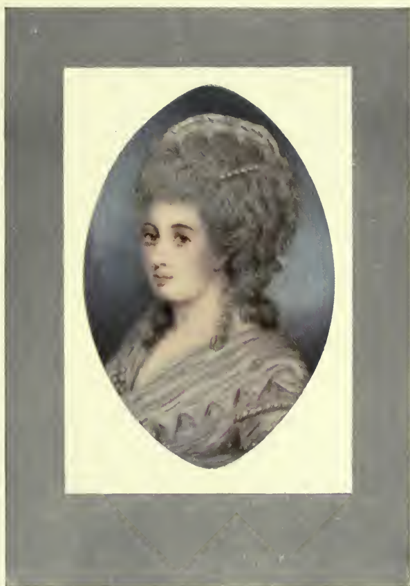
VISCOUNTESS ST. ASAPH ( NÉE LADY CHARLOTTE PERCY) SECOND WIFE OF GEORGE, VISCOUNT ST. ASAPH, AFTERWARDS THIRD EARL OF ASHBURNHAM BY RICHARD COSWAY, R.A.

1 2 3 4 5 6 7 8 9 10 11 12 13 14 15 16 17 18 19 20 21 22 23 24 25 26 27 28 29 30 31 32 33 34 35 36 37 38 39 40 41 42 43 44 45 46 47 48 49 50 51 52 53 54 55 56 57 58 59 60 61 62 63 64 65 66 67 68 69 70 71 72 73 74 75 76 77 78 79 80 81 82 83 84 85 86 87 88 89 90 91 92 93 94 95 96 97 98 99 100