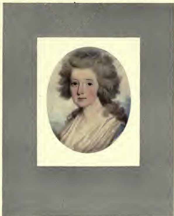
H.R.H. PRINCESS CHARLOTTE OF WALES (1796-1817) BY RICHARD COSWAY, R.A.