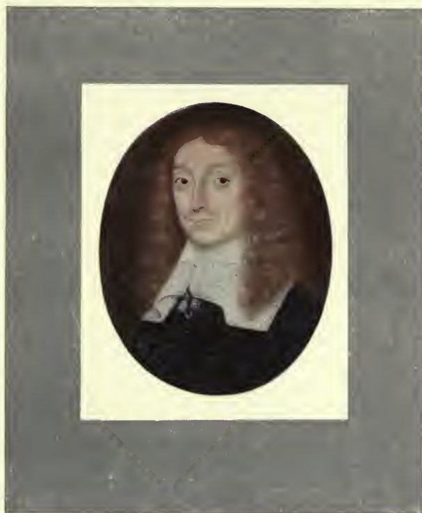
JOHN MILTON ARTIST UNKNOWN