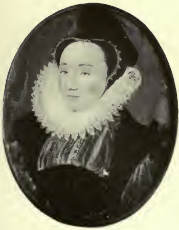
MARY, QUEEN OF SCOTS BY NICHOLAS HILLIARD