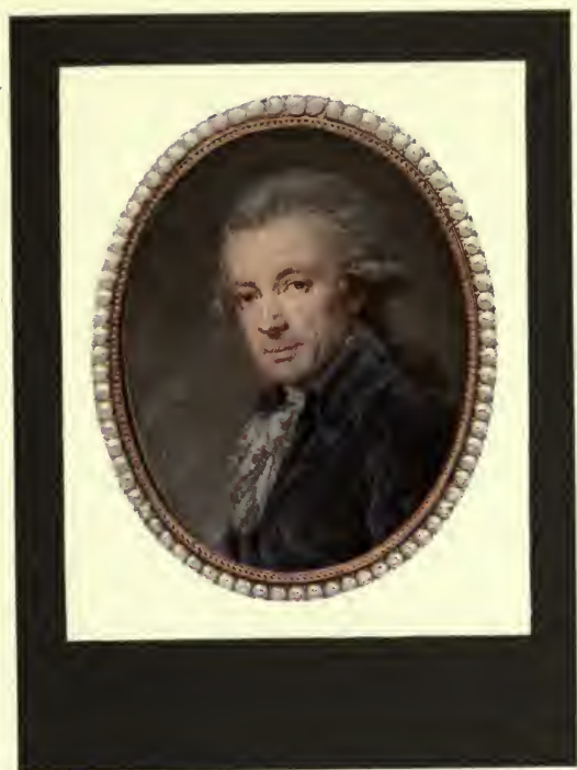
PORTRAIT OF THE ARTIST BY GIOVANNI BATTISTA DE LAMPI