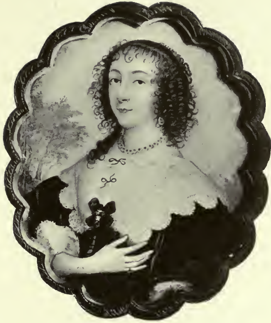
QUEEN HENRIETTA MARIA BY JOHN HOSKINS, THE ELDER