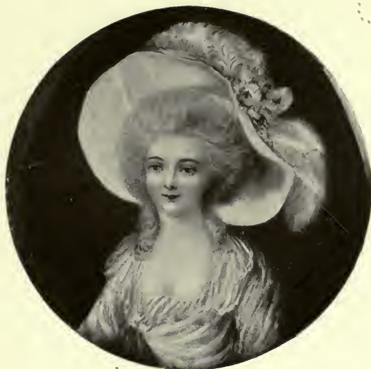
MADAME DUPIN (Ob. 1799) BY JEAN MARC NATTIER