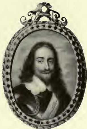
CHARLES I. BY P. PRIEUR