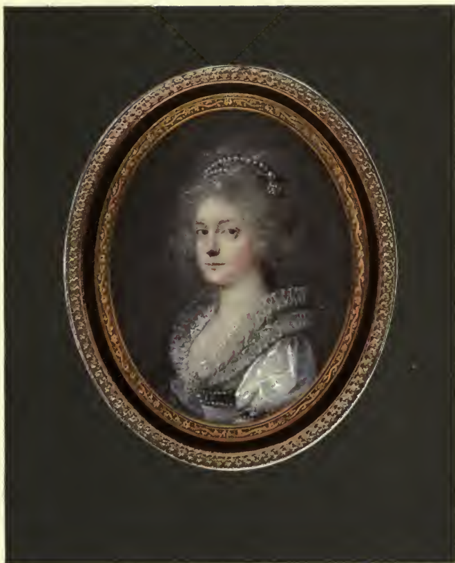
PORTRAIT OF A LADY—NAME UNKNOWN BY HEINRICH FRIEDRICH FÜGER (CIRCA 1790)