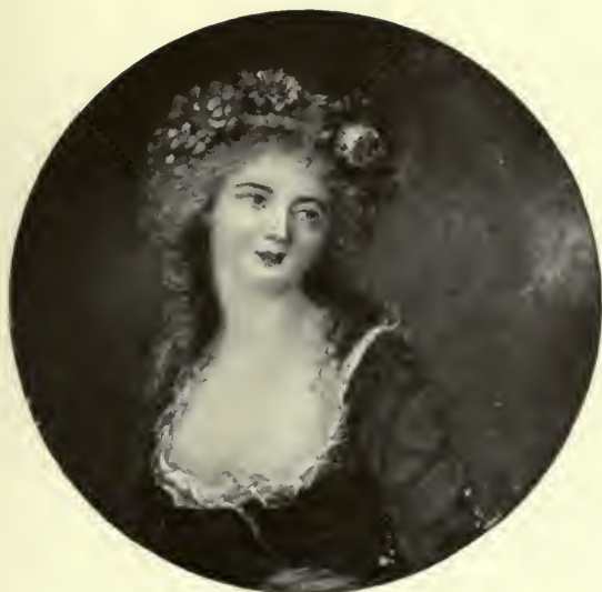
THE COUNTESS SOPHIE POTOCKI (Ob. 1822) BY P. A. HALL