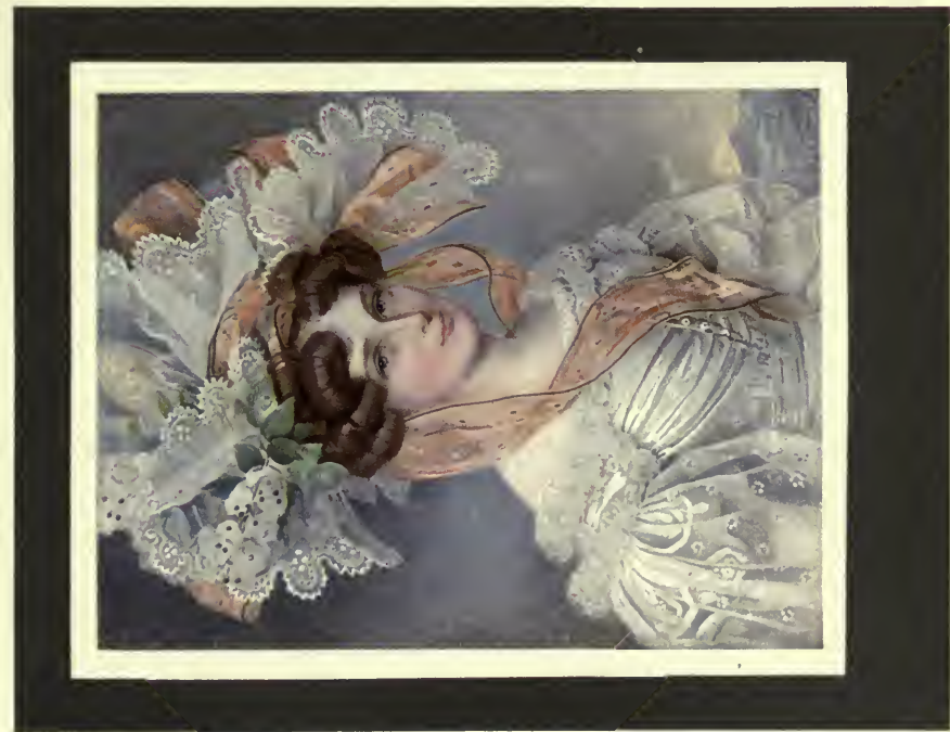
PORTRAIT OF A LADY—NAME UNKNOWN BY EMANUEL PETER