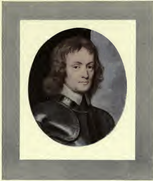
COLONEL LILBURNE (1618-1657) BY SAMUEL COOPER