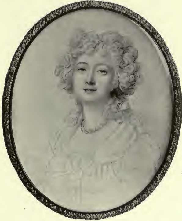
MADAME DU BARRY (1746-1793) BY RICHARD COSWAY. R.A.