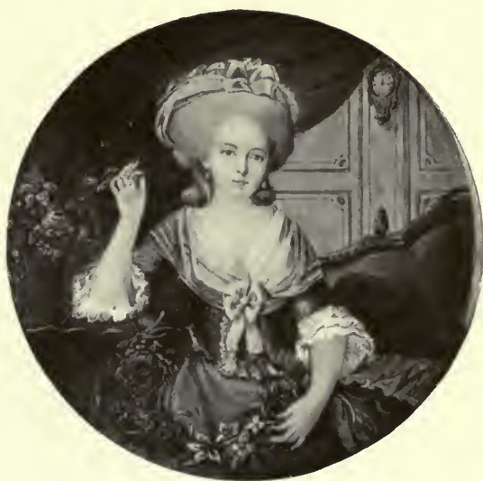
LA PRINCESSE DE LAMBALLE (Ob. 1792) BY P. A. HALL