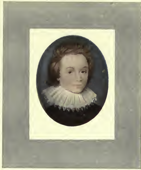
A SON OF SIR KENELM DIGBY BY ISAAC OLIVER (1632)