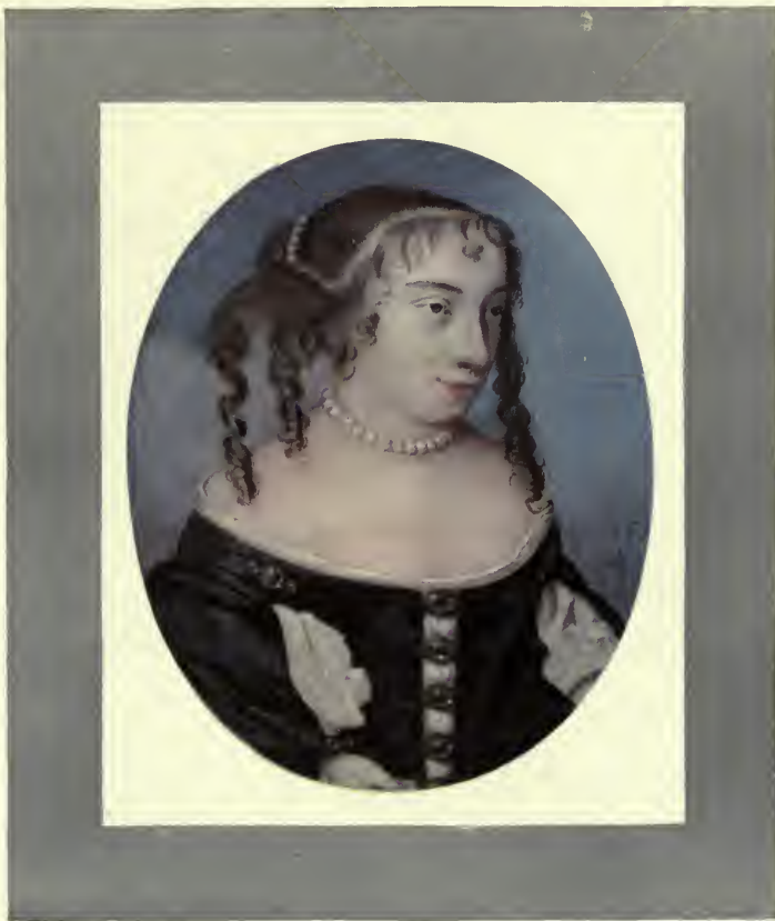
VISCOUNTESS FAUCONBERG, DAUGHTER OF OLIVER CROMWELL BY SAMUEL COOPER