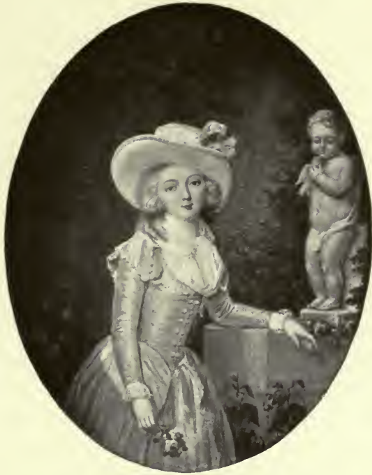
A GRAND-DAUGHTER OF NATTIER, THE ARTIST BY LOUIS SICARDI