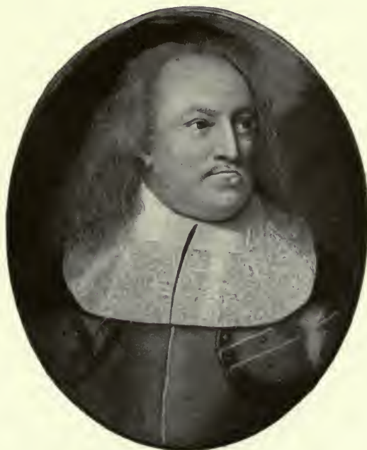
JOHN, EARL OF LOUDOUN (1598-1662) BY SAMUEL COOPER