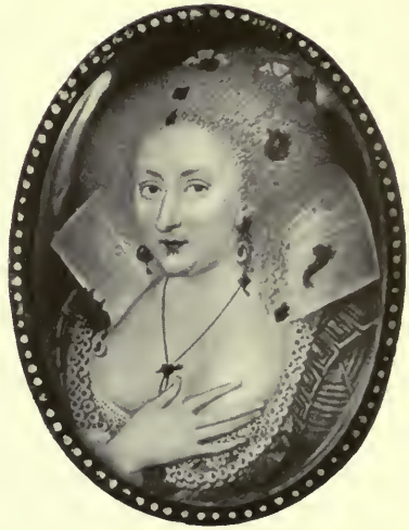
QUEEN ANNE OF DENMARK BY ISAAC OLIVER