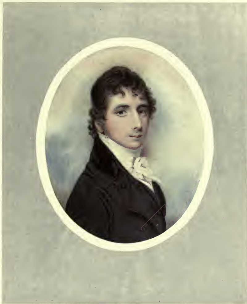
HENRY TUFTON, ELEVENTH AND LAST EARL OF THANET (1775-1849) BY RICHARD COSWAY, R.A.