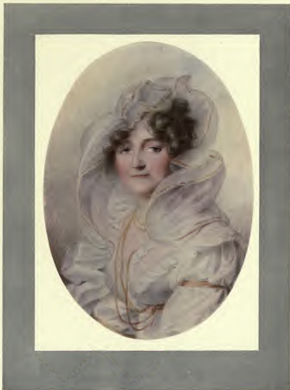
CATHARINE, COUNTESS BEAUCHAMP BY JEAN BAPTISTE ISABEY