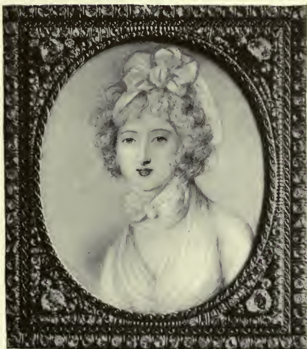
HENRIETTA, LADY DUNCANNON AFTERWARDS COUNTESS OF BESSBOROUGH (Ob. 1821) BY RICHARD COSWAY R.A.