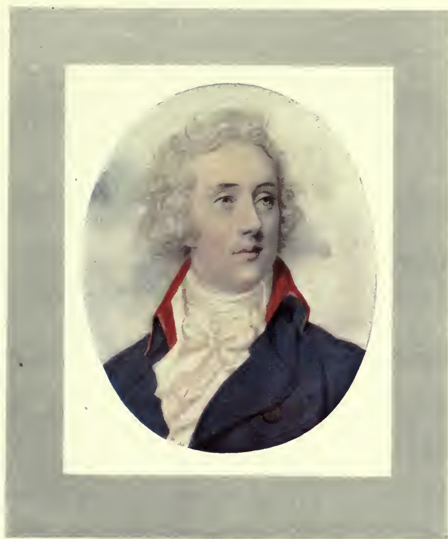
THE RT. HON. WILLIAM PITT BY HORACE HONE

FROM THE COLLECTION OF LADY MARIA PONSONBY