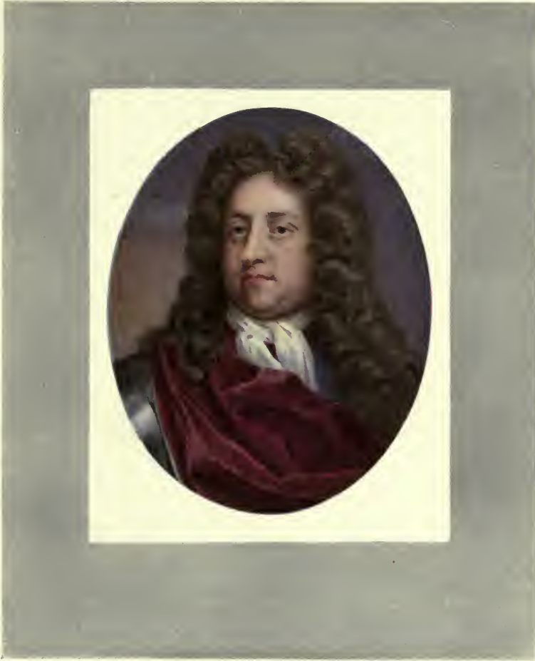
GEORGE, PRINCE OF DENMARK BY CHRISTIAN RICHTER

THE LIBRARY OF THE CONGRESS READERS ROOM 510 CONGRESS ST. WASHINGTON, D. C. 20540