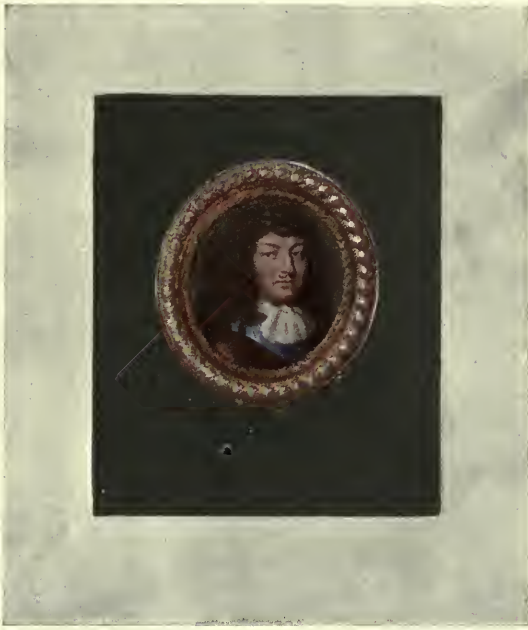
LOUIS XIV BY JEAN PETITOT, THE ELDER