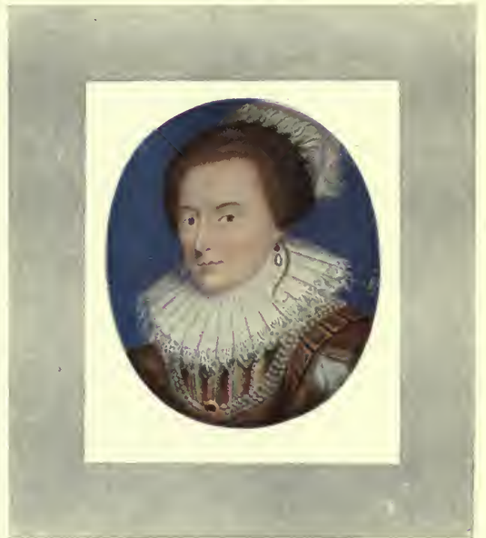
THE QUEEN OF BOHEMIA BY ISAAC OLIVER