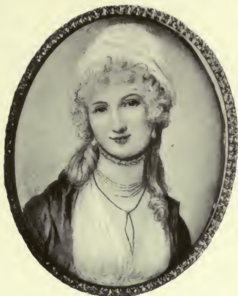
LADY AUGUSTA MURRAY WIFE OF THE DUKE OF SUSSEX BY RICHARD COSWAY R.A.