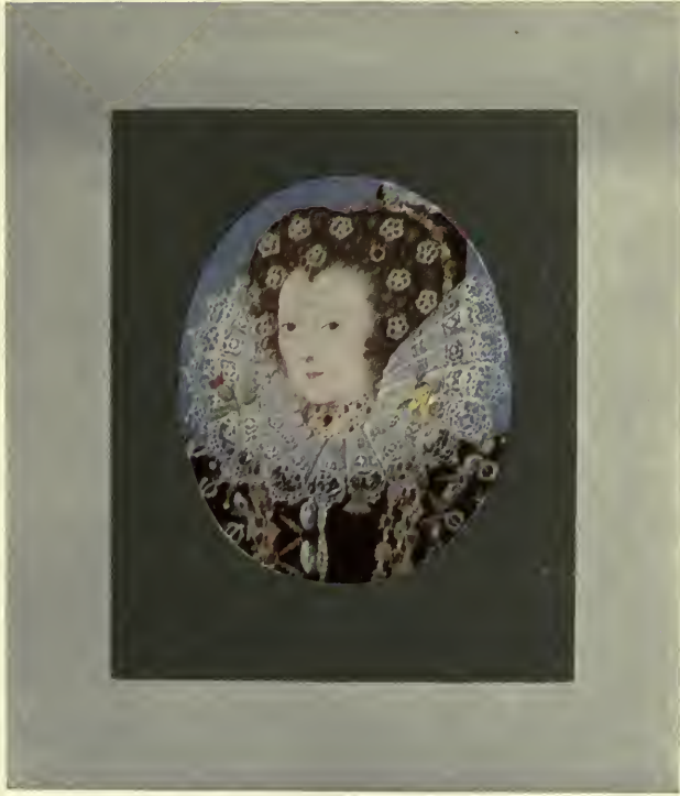
QUEEN ELIZABETH BY NICHOLAS HILLIARD