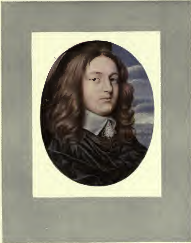
THE DUKE OF BUCKINGHAM BY JOHN HOSKINS, THE ELDER