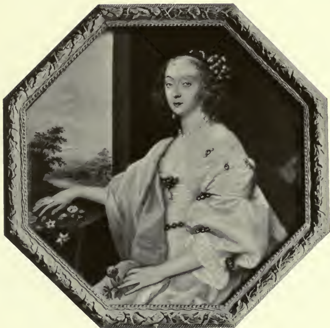
MARY, DUCHESS OF RICHMOND AND LENOX (1623-1685) BY JEAN PETITOT THE ELDER (1643)