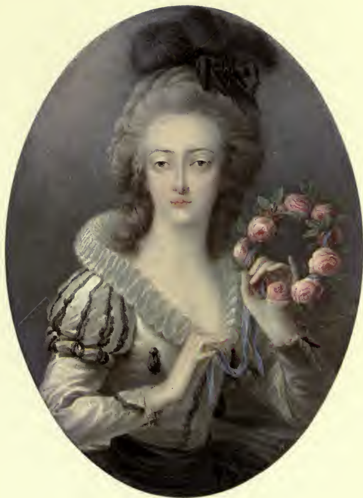
MARIE THERESIA, COUNTESS VON DIETRICHSTEIN BY HEINRICH FRIEDRICH FÜGER

LIBRARY OF THE MUSEUM OF FINE ARTS OF THE CITY OF BOSTON