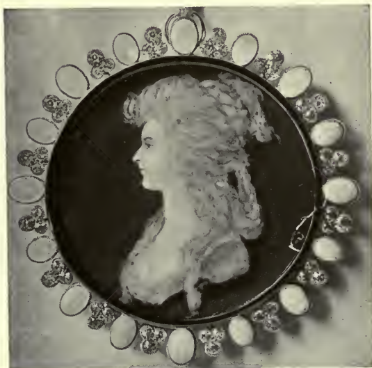
PORTRAIT OF A LADY (NAME UNKNOWN) BY PIERRE PASQUIER (1786)