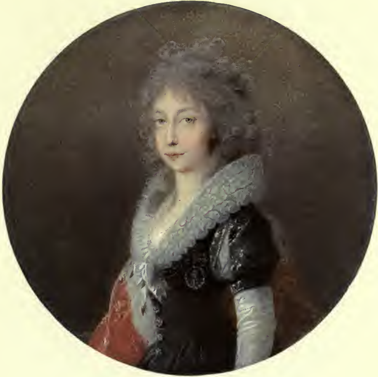
EMPERESS MARIA THERESIA, SECOND WIFE OF THE EMPEROR FRANCIS I OF AUSTRIA BY HEINRICH FRIEDRICH FÜGER

LIBRARY OF CONGRESS PHOTODUPLICATION SERVICE 955 LOCUST STREET, N.W. WASHINGTON, D.C. 20540