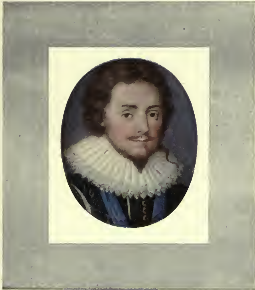
FREDERICK, KING OF BOHEMIA BY ISAAC OLIVER