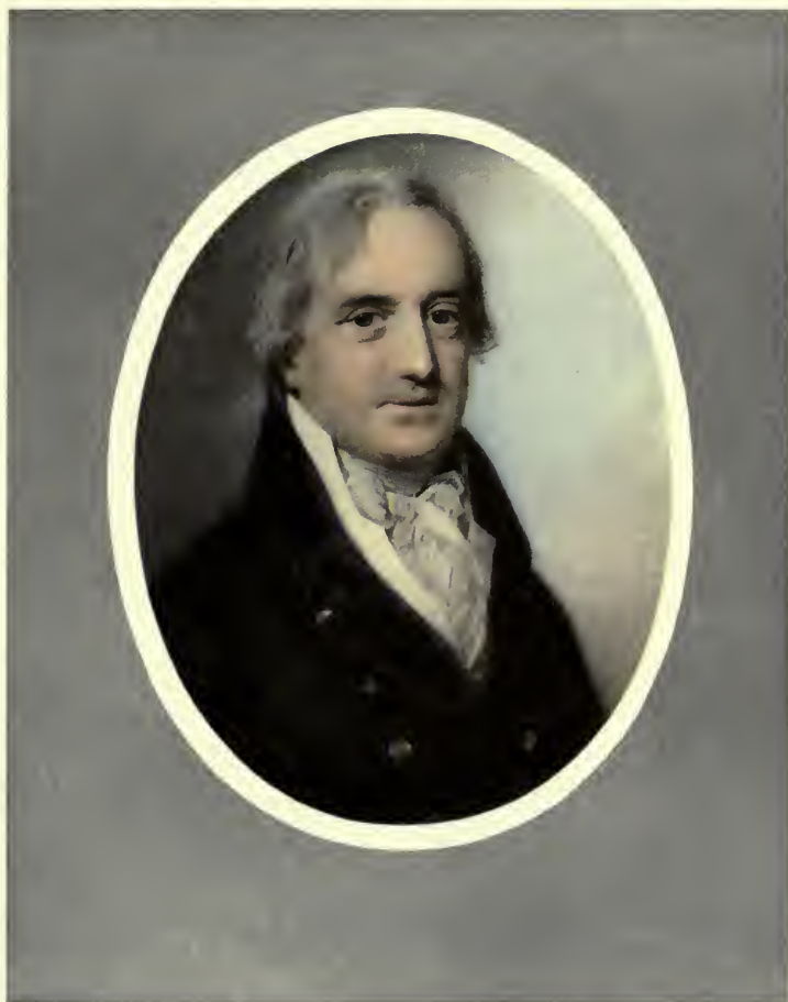
EARL BEAUCHAMP BY GEORGE ENGLEHEART (1805)