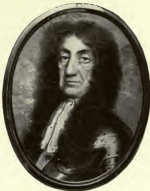
CHARLES II BY SAMUEL COOPER