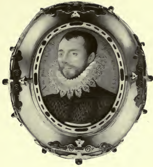
PHILIP II., KING OF SPAIN BY ISAAC OLIVER