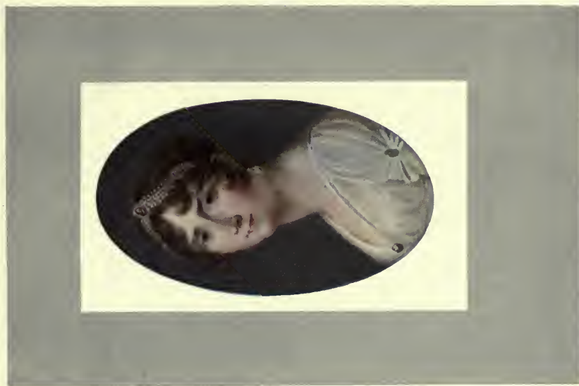
THE EMPRESS JOSEPHINE BY JEAN BAPTISTE ISABEY

THE EMPRESS MARIE LOUISE BY JEAN BAPTISTE ISABEY