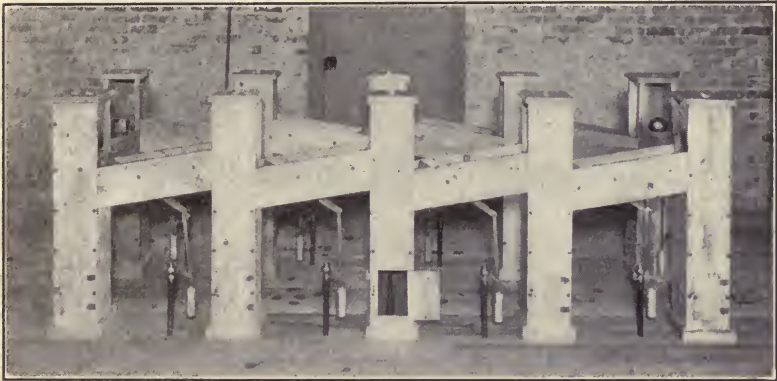
Automatic Controlling Device, Sewage Purification Plant, Lake Forest, Ill.

nor air-tight. It has no patent arrangements for inlet or outlet and is an open tank, housed over with a light structure, giving ample ventilation and opportunity for inspection, while preventing the hot sun of summer and the cold winds of winter from varying the temperature of the sewage to any unusual degree. After leaving the septic tank the sewage passes into a dosing chamber holding 7,000 gallons of liquid, and by means of an automatic device operated by the falling liquid, it is delivered in rotation on to ten intermittent sand filter beds, consisting of the natural sand of the beach of Lake Michigan as found at that place. The beds are of 3,200 square feet area each. At the present rate of flow these beds are working at the rate of 300,000 gallons per acre per day, their total area being three-fourths acre. This sand is quite fine, 85 per cent. passing a sieve of 40 mesh, and 42 per cent. passing 60 mesh to the inch.