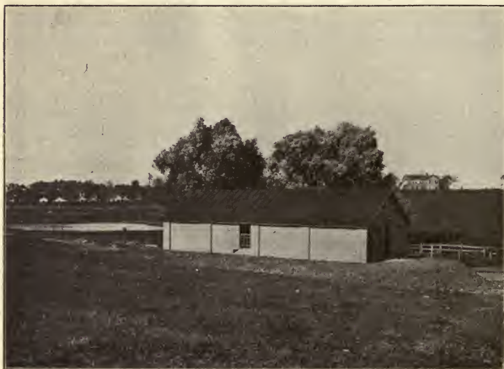
One of three Sewage Purification Plants built at Danville, Ky., in 1901.

A 60,000 gallon septic tank has been in operation about one year. It is built on the five compartment system and housed over. It does not re-