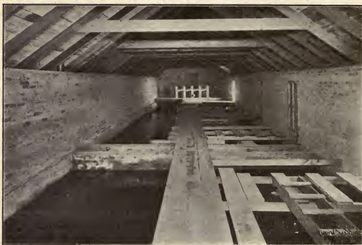
Interior of Sewage Purification Plant at Lake Forest, Ill., Showing Automatic Regulating Device.

improvement was seen in the amount of care which the beds had to receive. With fine sand used at this plant, it is probable that there will always be from ten to twelve hours of labor per week necessary to keep the beds in good condition. The septic tank is now operating with 6\frac{1}{2} hours rest period, the longest of any of the plants under notice, the sewage being thick and concentrated. The tank has not been cleaned during the year, and no perceptible deposit has occurred.