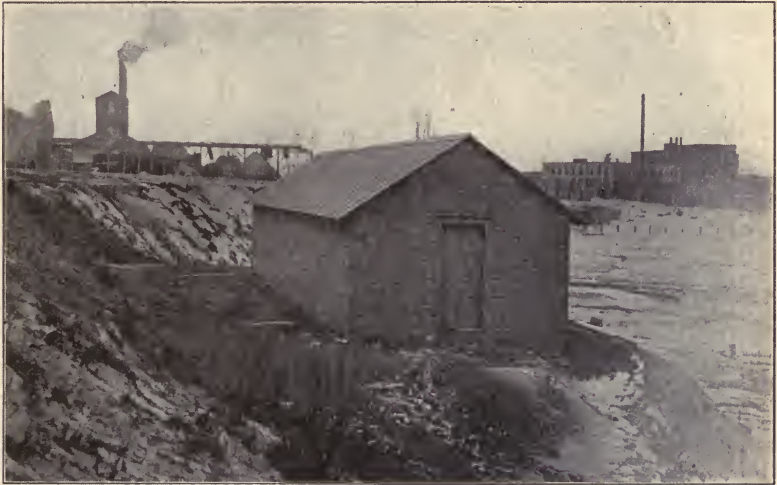
40,000 gallon Septic Tank at Holland in use since 1901.

Two septic tanks at Holland, Michigan, have been in operation over one year. The effluent is emptied into Black Lake. The sewage is not strong, as the sewer system is not yet extensive, but the tanks are exercising a marked improvement on the impurities, and so far have kept free