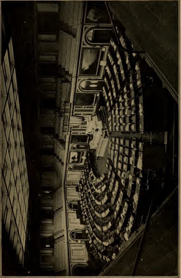
INTERIOR OF UNITED STATES HOUSE OF REPRESENTATIVES