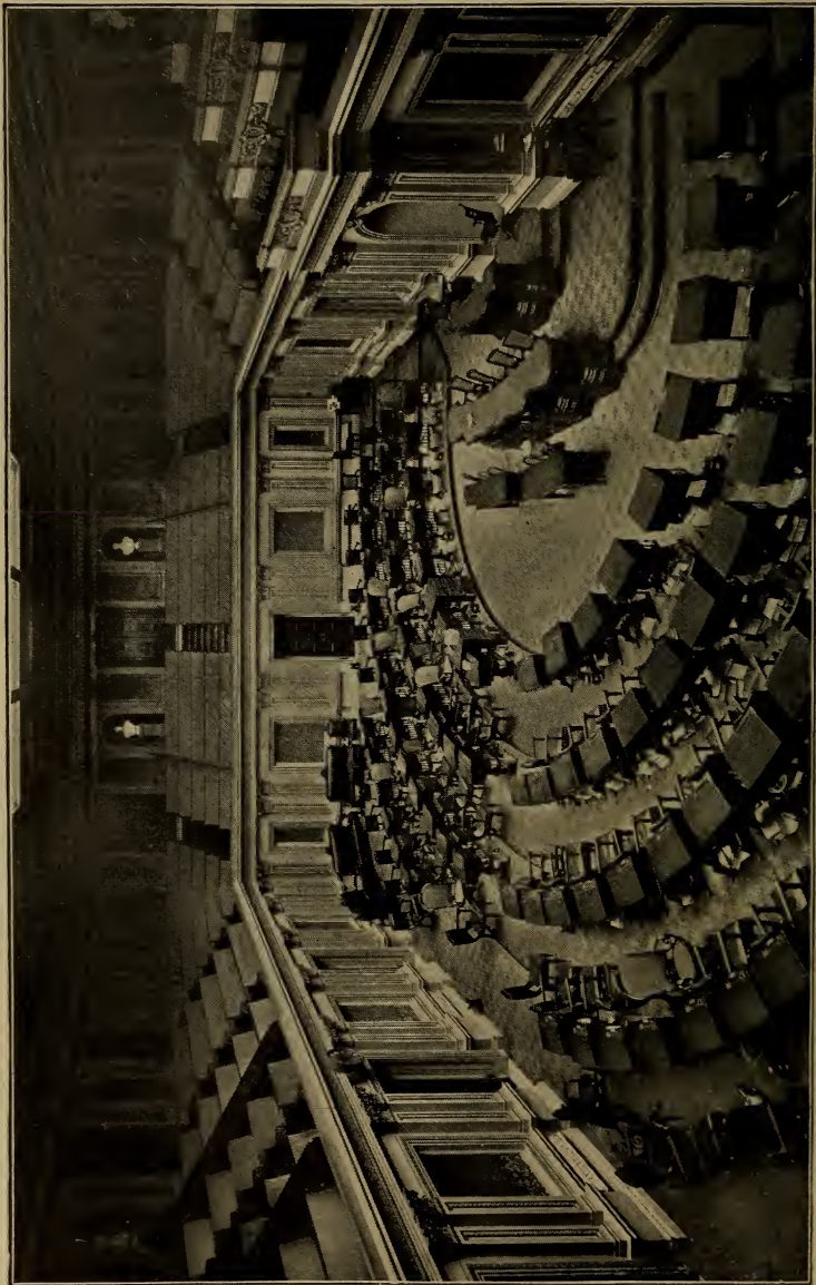
INTERIOR OF UNITED STATES SENATE CHAMBER