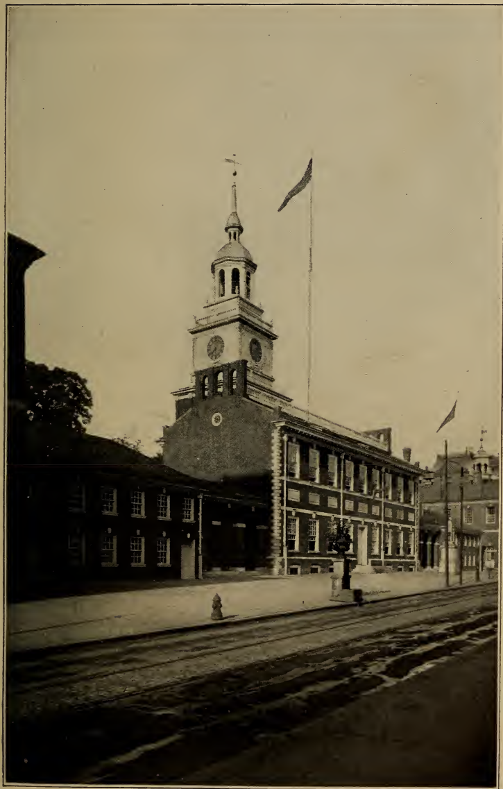
INDEPENDENCE HALL, PHILADELPHIA