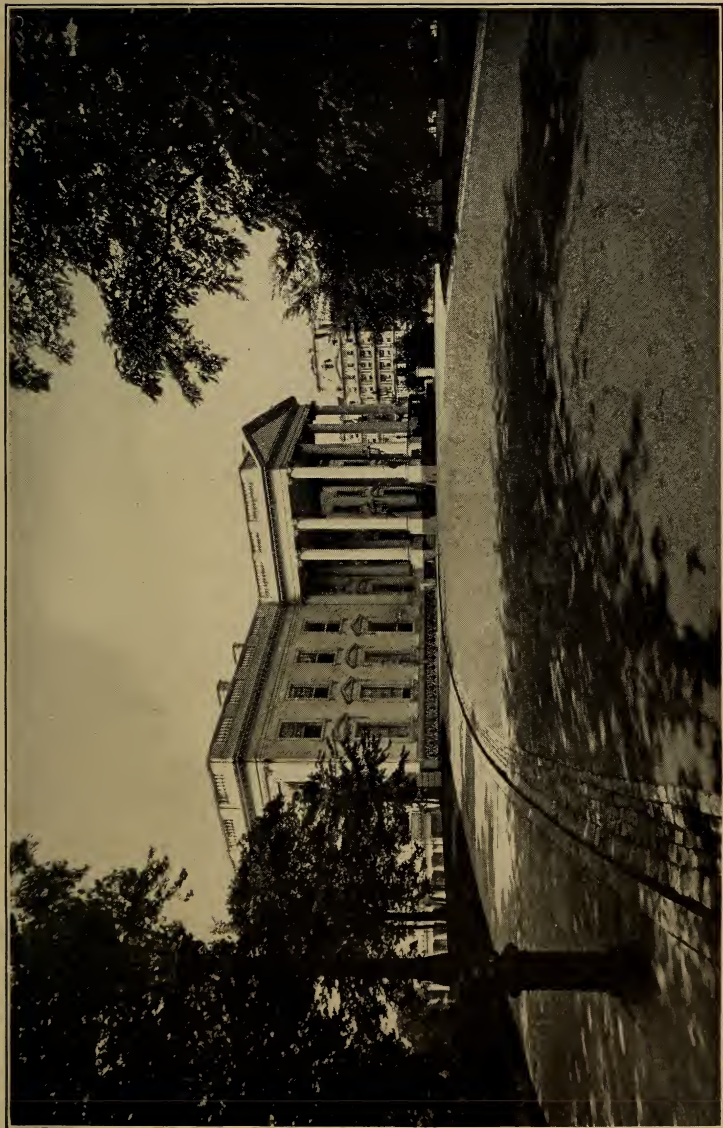
THE WHITE HOUSE, WASHINGTON