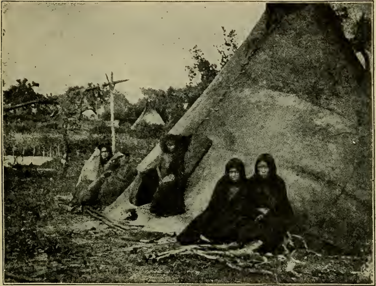
ARAPAHOE INDIAN CAMP

away there is a fresh skin hung over a pole to dry.