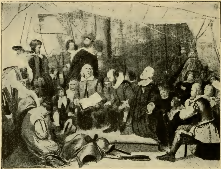
EMBARKATION OF THE PILGRIMS

the ship put in order. But they found she could not be made sound. So all that could crowded into the other ship, the Mayflower , and the rest of the band had to be left in England.