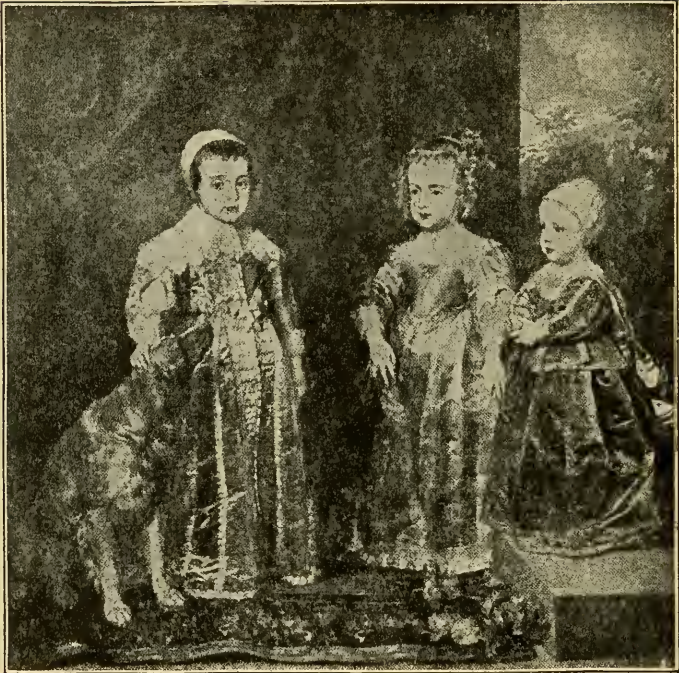
CHILDREN OF CHARLES I

Look at the picture (Children of Charles I.) of these three children with their pet dog. You can tell that the dog is their playfellow and that he loves them, by the way he has taken his place at their side, and by the loving, trustful manner in which he looks up into the face of the boy whose hand rests on his