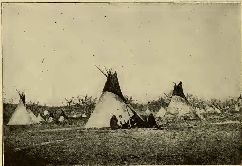
COMANCHE INDIAN CAMP

Indian village looks. The Arapahoe Indian Camp (1342) gives a nearer view of one of the tents, and we can see how the skins are pieced together and stretched to make a covering.