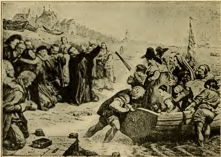
DEPARTURE OF THE PILGRIMS FROM DELFT HAVEN

Although they did not have much money, they managed finally to get two ships in which to sail