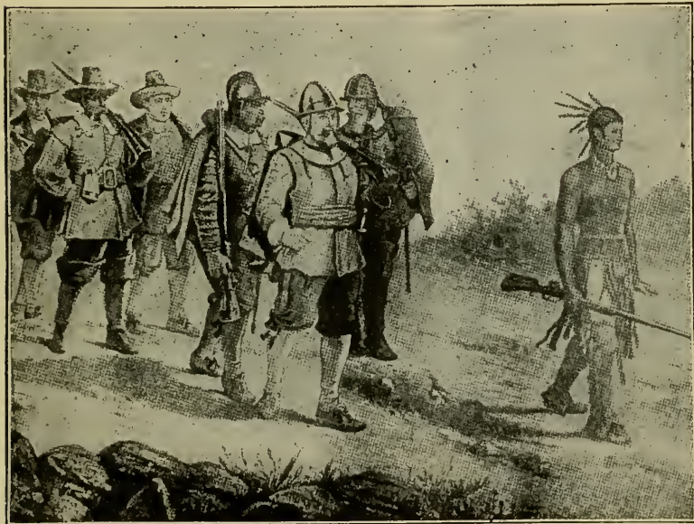
MILES STANDISH AND HIS SOLDIERS

Now came many troubles and hardships. The