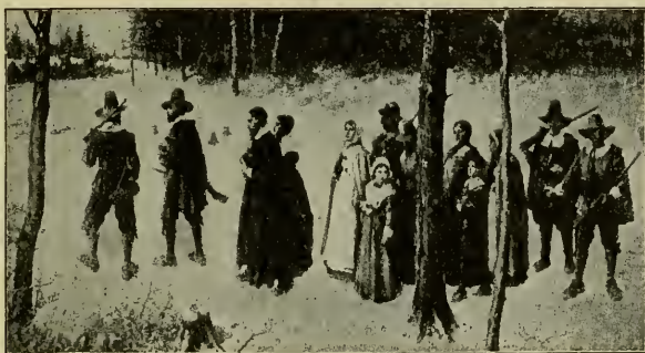
PILGRIMS GOING TO CHURCH

Have you noticed that in all of the pictures in which it has been possible to put a Bible, the differ-