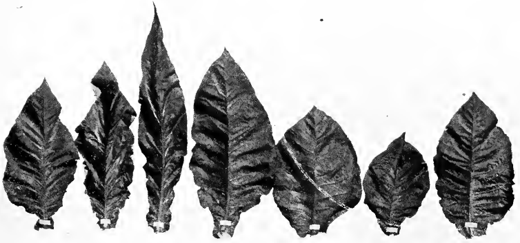
Differences in characters of leaves from plants of the same variety of tobacco.