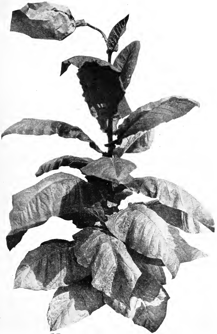
Flower Head protected from foreign pollen ("cross-fertilization"), by a manila bag.