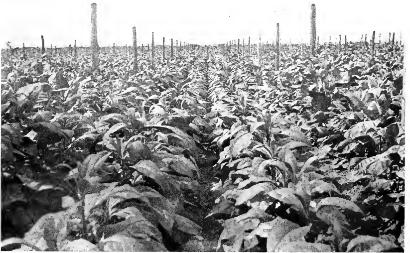
Fig. B. Uniformity in Tobacco Plants from Self-fertilized Seed of Belgian type.