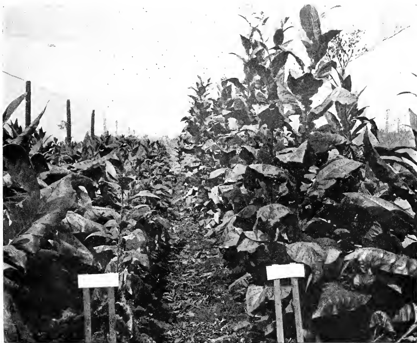
Resistant and semi-resistant Plants growing on infected Soil.