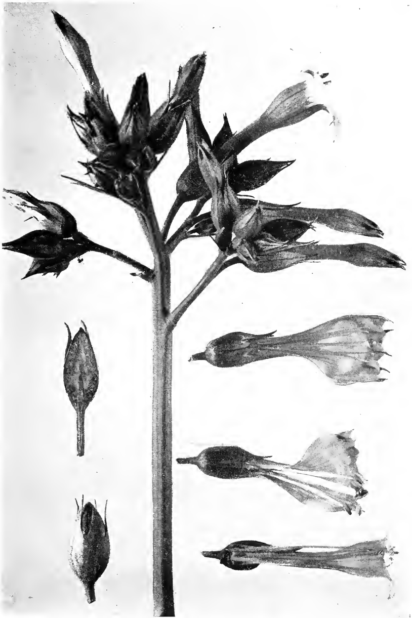
A Flower-Head of Tobacco ready to cover. The opened flowers show position of anthers and stigmas at time of fertilization.