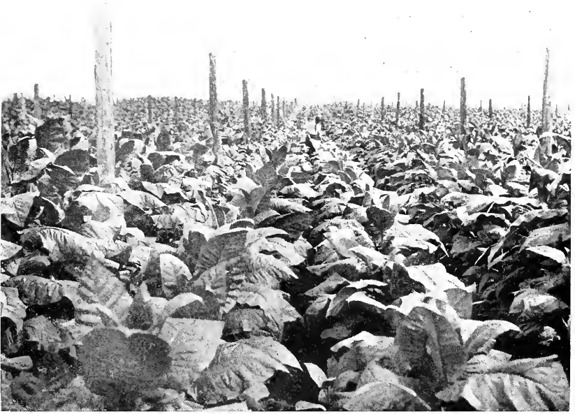
Fig. A. Uniformity in Tobacco Plants from Self-fertilized Seed. The two central rows of one strain ; adjoining rows from a different strain of same variety.