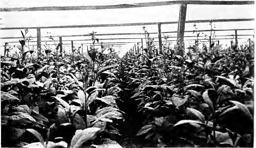
Tobacco grown in Connecticut from Seed just imported from Cuba, showing freak plants and irregular stand.